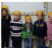
The Kindergarten makes silly faces sporting their Christ crowns!