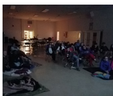
Lights out as movie-goers enjoy "Big Miracle" at Corbaley Hall.

Our last movie night featuring "Big Miracle" drew a big crowd and was a great night out for our families. We had a potluck-style dinner to start, and we all enjoyed delicious meatballs, mac and cheese, chili, and fried chicken. Yum! The movie was really enjoyable, and we are looking forward to doing it all again!