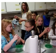
The 3rd Grade heads to the kitchen to be creative!