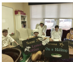
Just some 7th grade angels hangin' out!